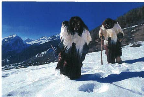
The Engadine ski marathon passing through the upper Engadine Valley